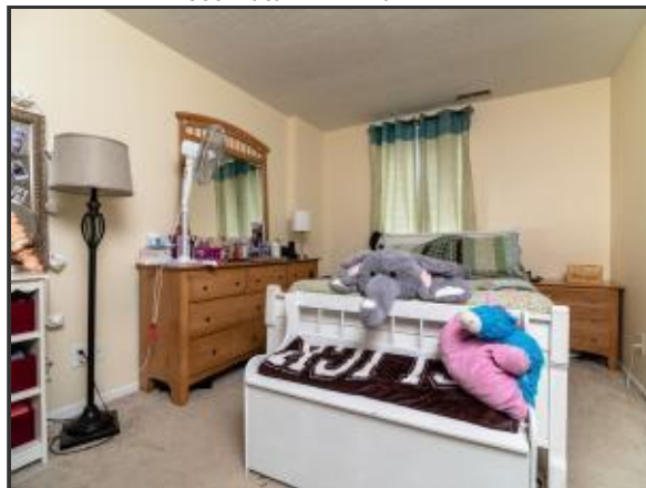
Lower level bedroom/Guest Room/ Workout room with egress window