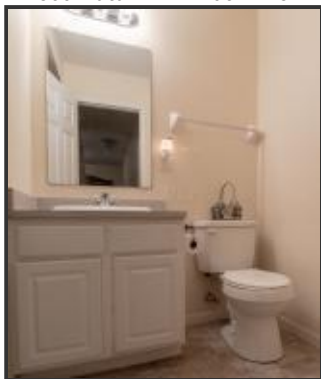
Lower level bath also has a full bath