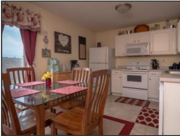
Spacious kitchen work area