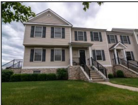
500 Autumn Front A1