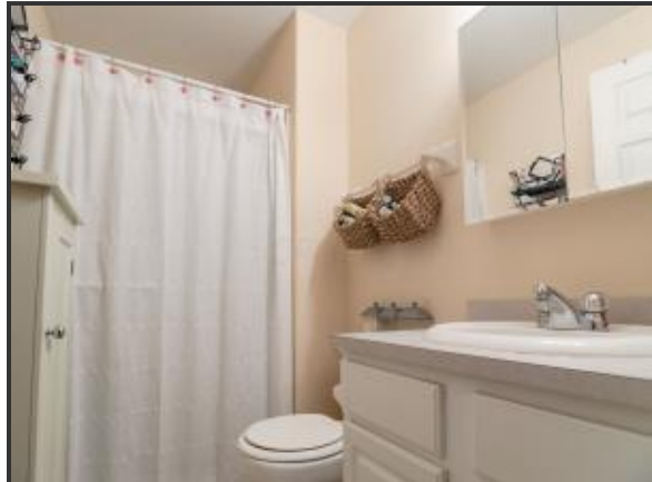
Owner's suite private bath