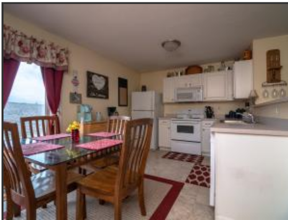
500 Autumn Kit A6