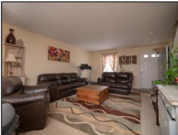
500 Autumn LV B5