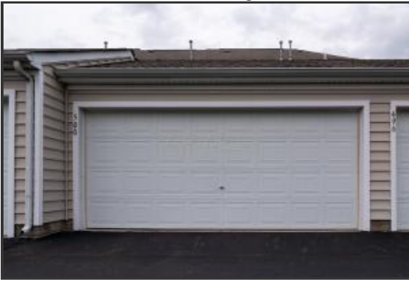
2 car garage!