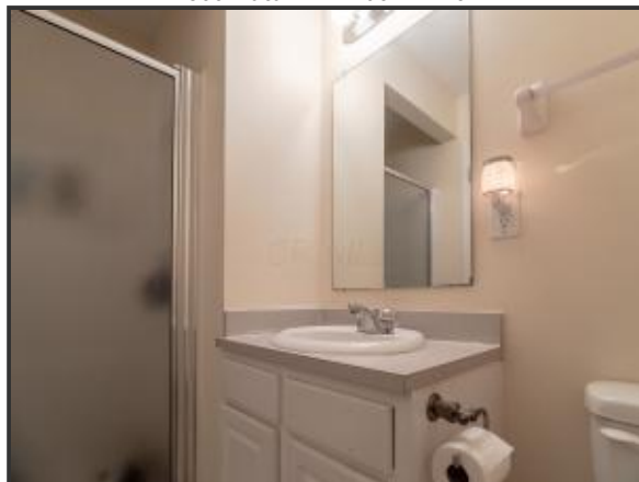
Lower level bath with a shower