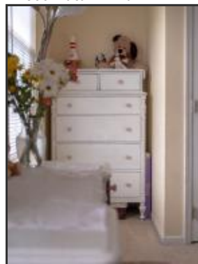
Quaint niche in this sunny bedroom