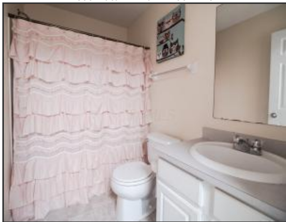
Additional private bath for second bedroom