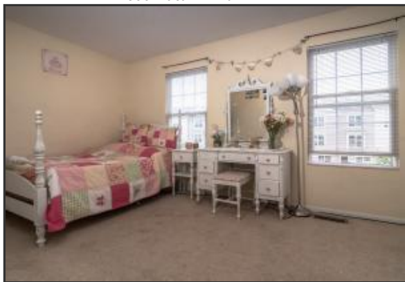
Generous size additional bedroom upstairs