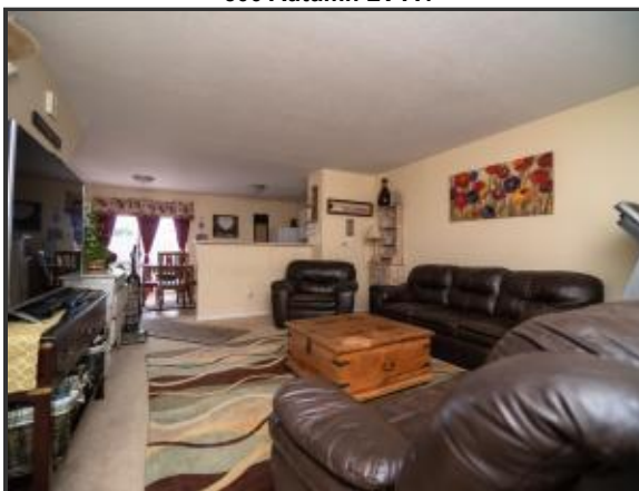
500 Autumn LV A4