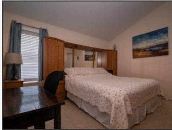
Owner's suite with private bath