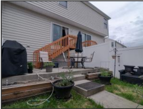
Room for a grill, flower beds, patio furniture