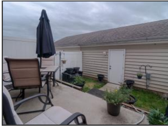
Slider from kitchen to private patio